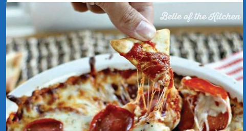
Belle of the Kitchen